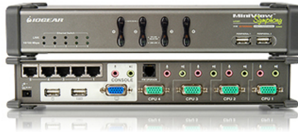
Miniview Symphony Multi-function 4-Port KVM Switch (GCS1774) Miniview Symphony Multi-function 4-Port KVM Switch, KVM/USB2.0 Peripherals Networking/Audio, 4-Port